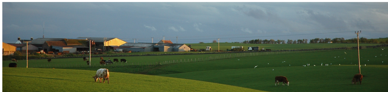
South Baldutho looking towards Edinburgh